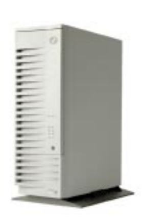
IBM PC Server 330 An application-based e-business performance server, offering large-system control in a PC network environment