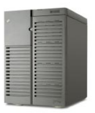
IBM PC Server 704 A top-of-the line enterprise PC Server for computeintensive applications