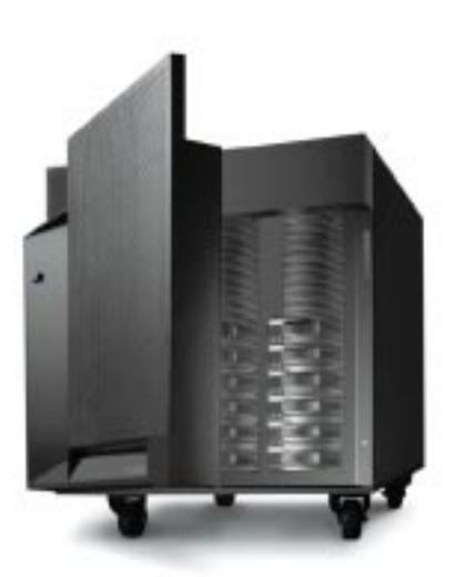
IBM Netfinity 7000 A powerful enterprise server to drive business-critical applications with confidence