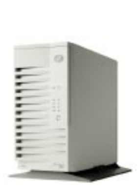
IBM PC Server 325 The scalable, rackable application server for enhanced productivity