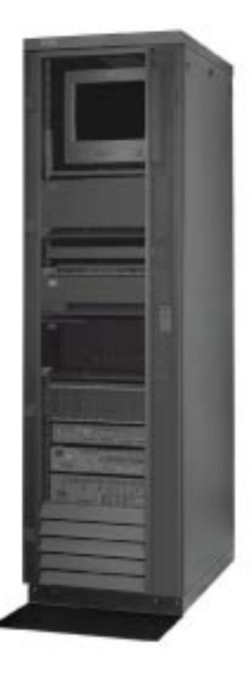
IBM Netfinity Rack An expandable, spacemanagement solution for 19" industry-standard server and options components